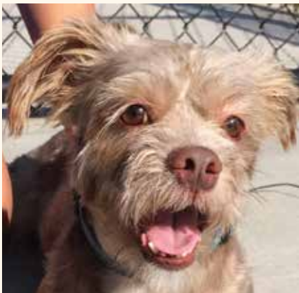
Manny was the first of our Hurricane Harvey dogs to find a forever home in the Capital Region.

Within an eight-day span in September, the Mohawk Hudson Humane Society (MHHS) accepted 70 animals displaced by Hurricanes Harvey in Texas and Irma in Florida. Many residents were forced to evacuate their homes, leaving them little choice but to bring their pets to shelters. The areas closest to the disasters were quickly faced with overcrowding, but efforts coordinated by HSUS and ASPCA resulted in the mass transport of pets to shelters with available kennel space near and far.