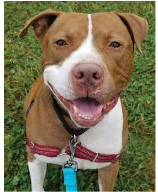
Thanks to our Guardian Angel Fund, Cinderfella received advanced veterinary care.

There were tears all around when this happy reunion took place —