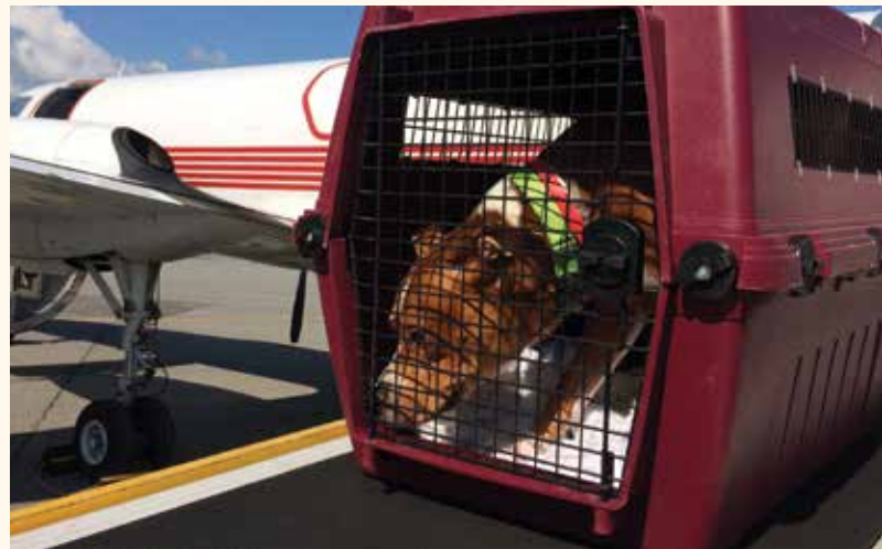
Precious cargo of 46 cats and dogs arrived from Florida following Hurricane Irma.

Twenty-four dogs came from Texas to find forever homes in the Capital Region. Some of those pets were adopted quickly, including an adorable pug-terrier mix named Manny. He arrived with a lengthy note from his caretakers in Houston attached to his carrier.