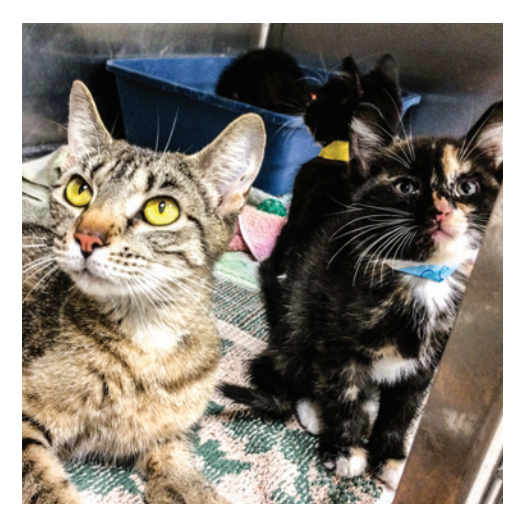
A mother cat and her litter stay comfy and healthy in the Nursery.

Our new Animal Care Center has many specialized rooms for specific care purposes. One of those is our Nursery, a space exclusively for moms and their litters and orphan kittens as well. Because kittens are one of our most vulnerable populations, the Nursery was specially designed to provide a safe, stress-free and healthy place for these little ones to grow.