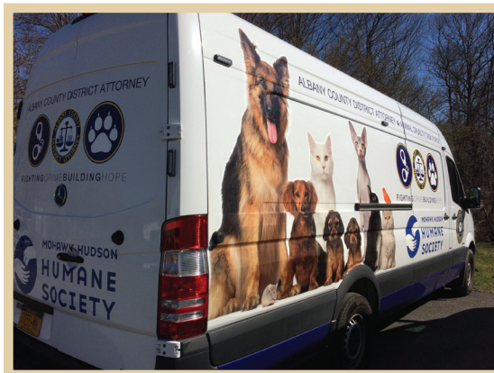
The animal abuse response vehicle was provided by the "Making Crime Pay" program of the Albany District Attorney's Office.